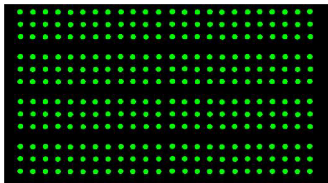
Figure 1: Representative image showing 3 replicates of BSA sample across 4 miniarrays. Good spot morphology and consistent spot positioning can be observed across all arrays.

Results obtained following intra batch and inter batch slide analysis represent good printing reproducibility (~5% CV values) and spot size consistency using Arrayjet Marathon microarrays. When a protein sample such as BSA was printed onto Schott Nexterion® epoxysilane slides, high quality reproducible spots were produced with minimum spot to spot, slide to slide and batch to batch variability. Furthermore, the accurate nozzle performance of the print head combined with rapid on the fly printing makes Arrayjet non-contact technology ideal for manufacturing multiple slide batches over time.